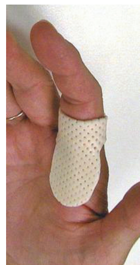
Orthosis for Trigger Finger

The physician may refer the patient to a hand therapist for non-operative and post-surgical treatment. For non-operative treatment, the certified hand therapist has specialized training to fabricate a custom orthosis to rest the finger, and to teach the patient exercises to avoid stiffness during the healing process. The certified hand therapist will also discuss ways to modify activities while the finger is healing. Hand therapy following surgery will improve range of motion, and teach the patient how to regain the function of the hand.